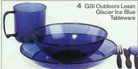
4 GSI Outdoors Lexan Glacier Ice Blue Tableware

1 | Coleman Exponent Xcursion Lantern ($40) The focused beam of a headlamp is perfect when you're digging in the corners of a tent for lost socks, but to create some campsite ambience — or to sufficiently illuminate that fireside poker game — you need a lantern. The 14-ounce, palm-held Xcursion is your best pound-for-pound option. Barely larger than a traditional candle lantern, it burns ten times as bright and runs on a refillable Coleman Powermax butane/propane cartridge that lasts for six hours. (800-835-3278 or coleman.com )