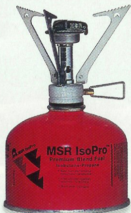
2 MSR PocketRocket Stove